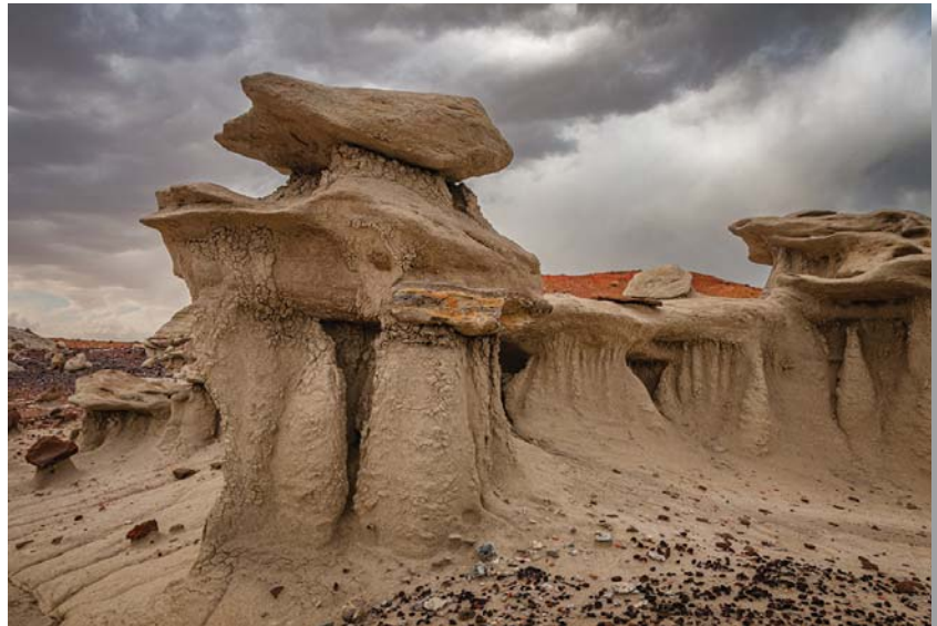
Rock Formation at Bisti Badlands, New Mexico